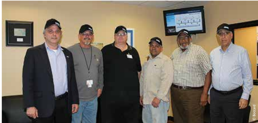
Boccard’s top employee donors wearing their Handicap International hats.